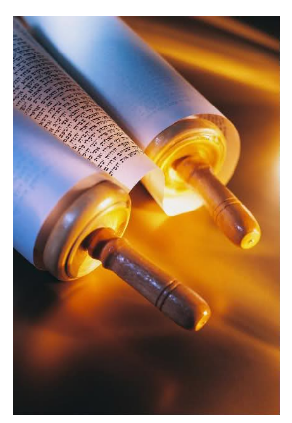
THE BOOK OF ZECHARIAH