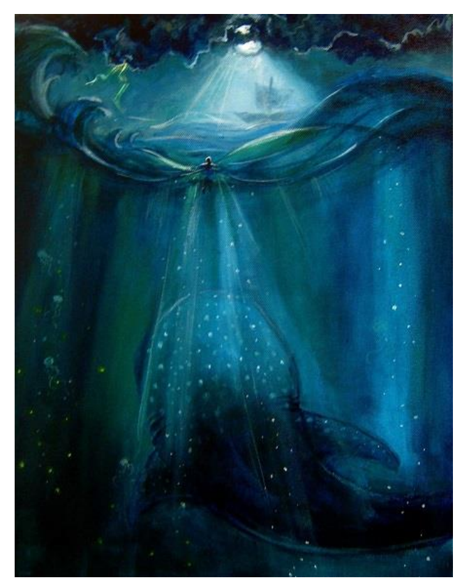
THE BOOK OF JONAH